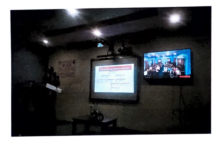
Snapshot from the interactive session.