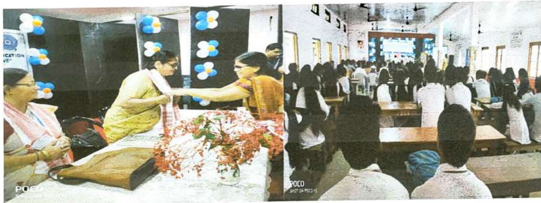
Felicitating of guests(left) & gathering during inaugural ceremony(right)