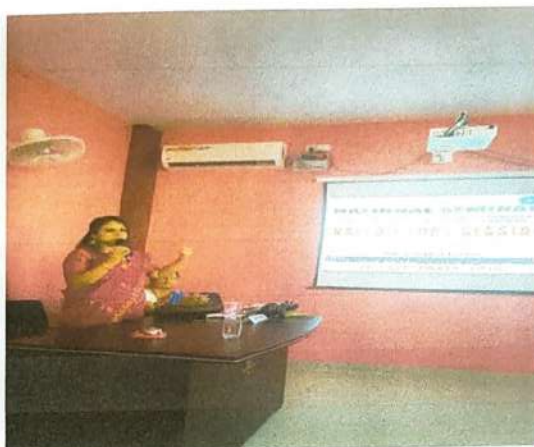
Feedback from participants(left) & Guest speaking in valedictory session(right)