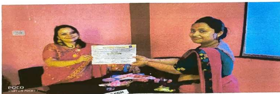
Distribution of certificates