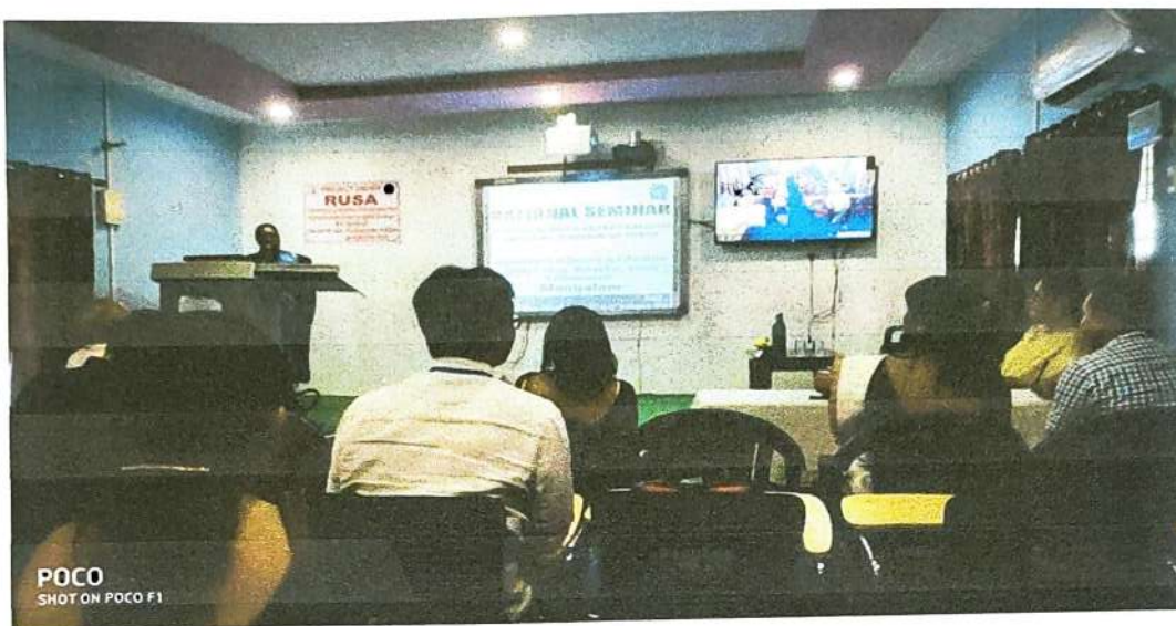
Glimpses of first technical session.