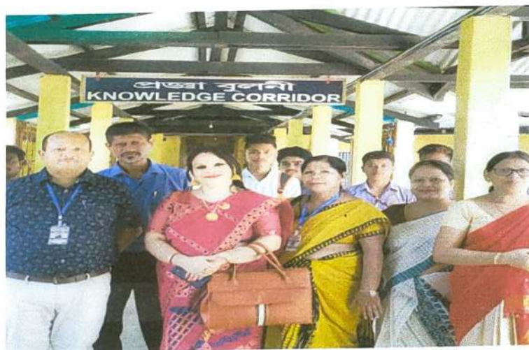
Teachers & students of Dept of History & Education with Guests during the seminar