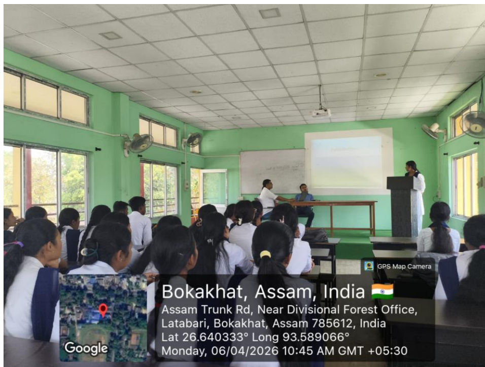
Image 1: Audience and Presenter – Overview of the Presentation Session